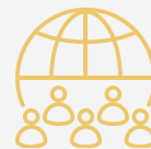
App-Based Society Management