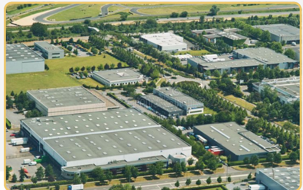
Green Field Industrial Park