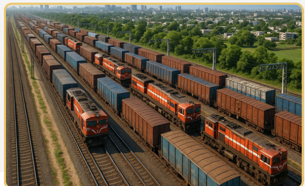
Dholera Freight Corridor