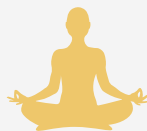
Yoga Deck & Senior Citizen Zone