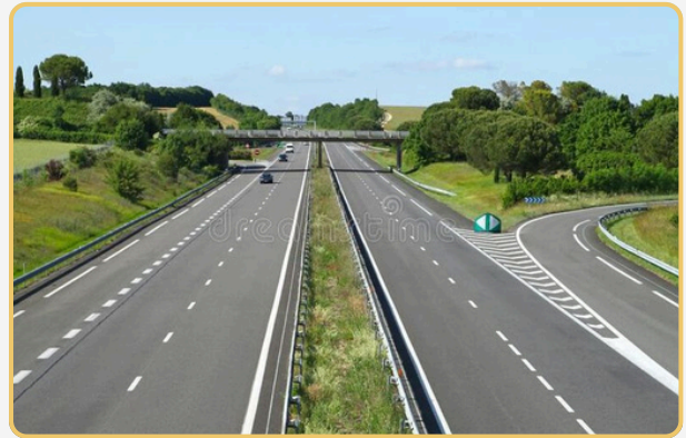
Ahmedabad - Dholera Expressway